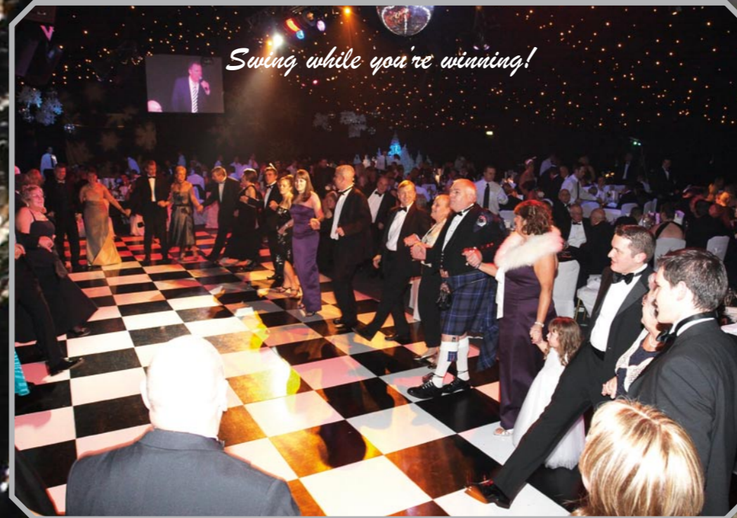
Swing while you're winning!